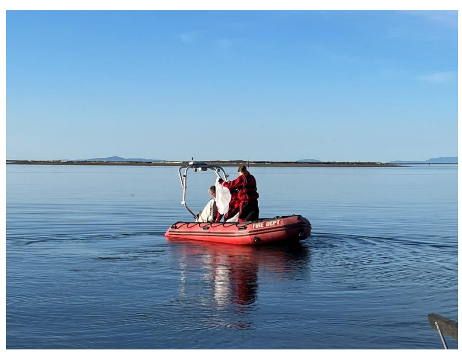
Figure 1: Marine 34 Protecting EMS Gear for Transport