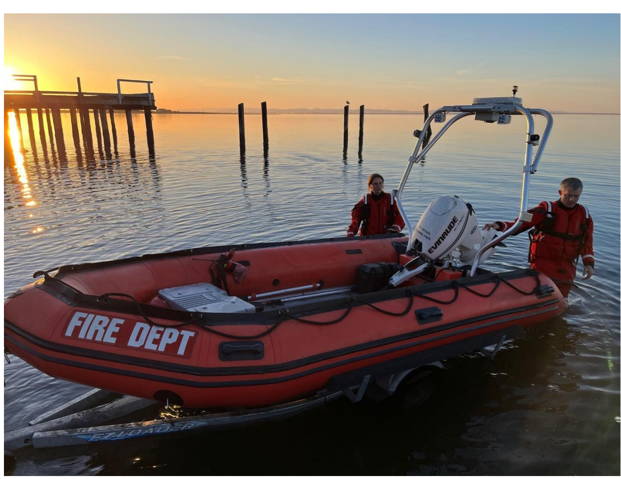
Figure 3: Marine 34 Back by Sunset